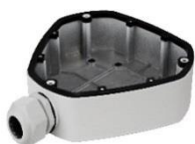
DS-1280ZJ-DM25 Junction Box