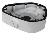
DS-1281ZJ-DM25 Inclined Ceiling Mount