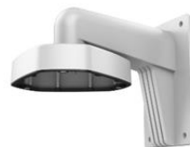
DS-1273ZJ-DM25 Wall Mount